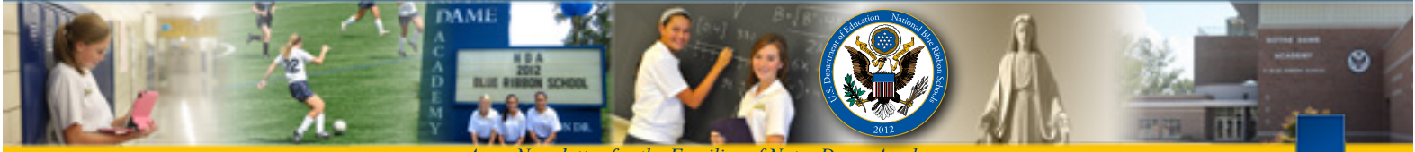
An e-Newsletter for the Families of Notre Dame Academy